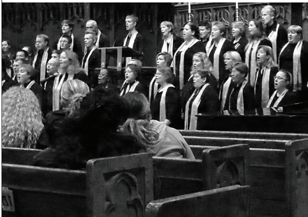
One Voice Mixed Chorus at Plymouth Church, Oct. 28, 2012

1900 Nicollet Ave., Minneapolis www.plymouth.org