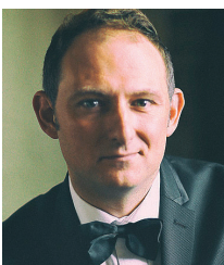
OVATION MUSIC DIRECTOR